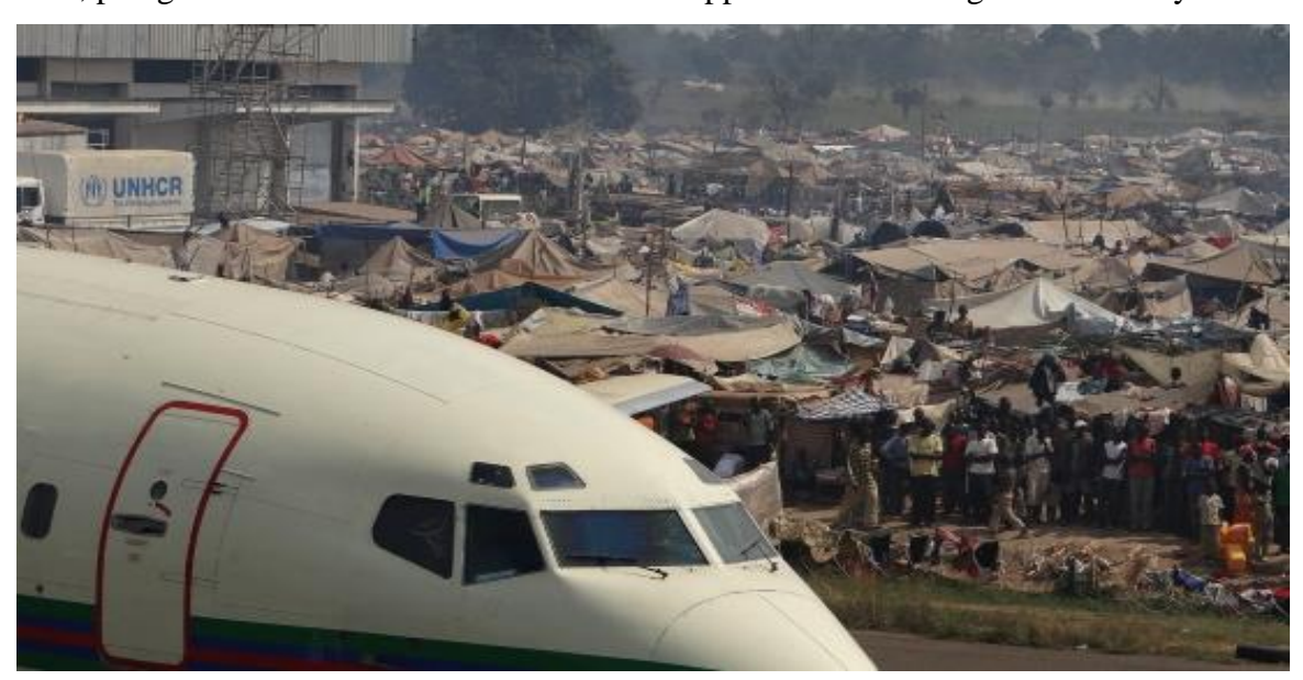
Arrival of a World Food Programme cargo plane in Bangui in front of a camp for internally displaced persons <sup>42</sup>

The crisis has left the population in dire need of humanitarian assistance as around two million people do not have enough food, 65% lack access to clean drinking water, and 800,000 have had to leave their homes to seek refuge in other parts of CAR or neighboring countries. The last donor conference that was attended by 80 international donors in Brussels on 17 November 2016, pledges of US$ 2.2 billion were made to support the rebuilding of the country.