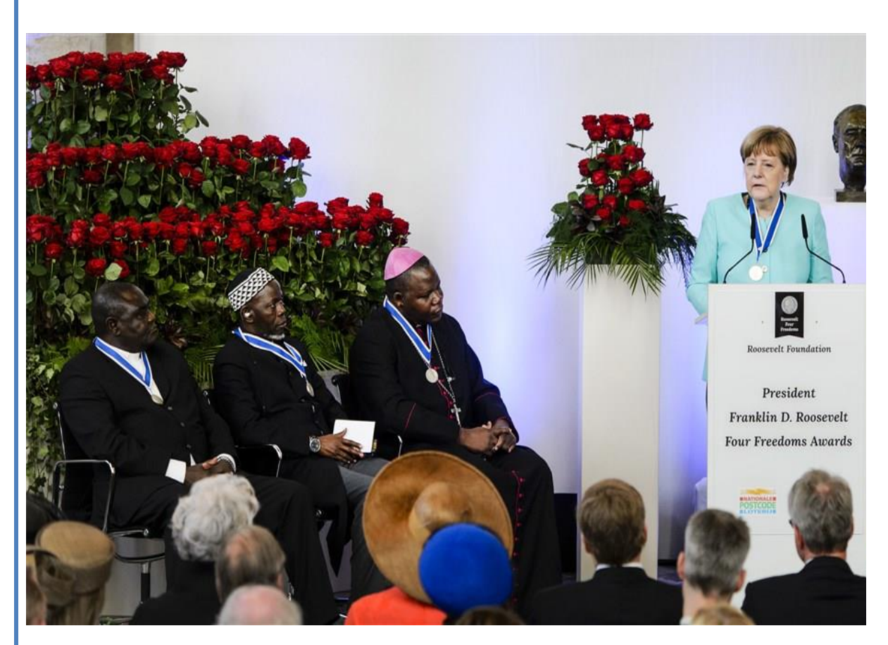
The Interfaith Peace Platform receives one of the Four Freedom Awards