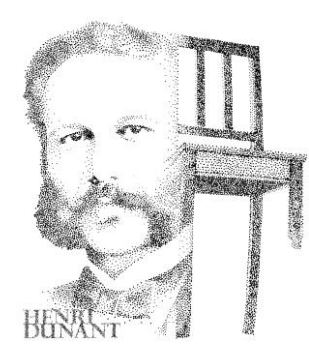
Henri Dunant Series 3